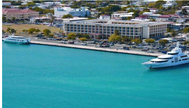
Holiday Inn Winward Passage

A second slots only casino opened on St. Thomas. The Holiday Inn Winward Passage joins the Wyndham Sugar Bay as the only two “Gaming Centers” on St. Thomas. There are Video Lottery Terminals scattered around the island in bars and lounges. The only casino in the U. S. Virgin Islands is the Divi Carina Bay on St. Croix.