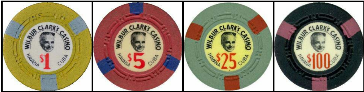
Set of Wilbur Clark Casino chips from Havana, Cuba - $1, $5, $25 and $100

WC-1a, WC-5a, WC-25a and WC-100a - $449.99