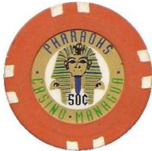
Real 50c Chip