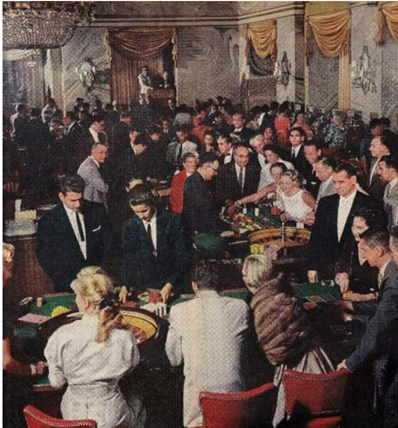
IN THE ELEGANT CASINO OF THE NACIONAL OF THE NACIONAL HOTEL IN HAVANA.