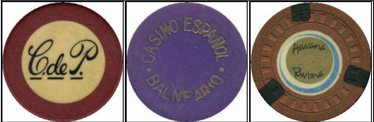
Casino de Ponce, PR

CNV-Ra, CNV-Rb, CNV-Rd and CNV-Re - $169.00