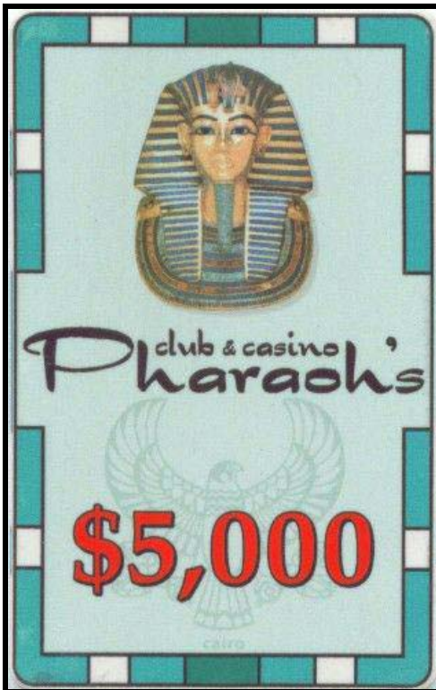
Fantasy Plaque - $5,000