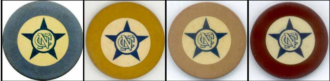
Set of Club Nautico de Varadero, Cuba - Crest & Seal roulette chips

WC-1a, WC-5a, WC-25a and WC-100a - $449.99