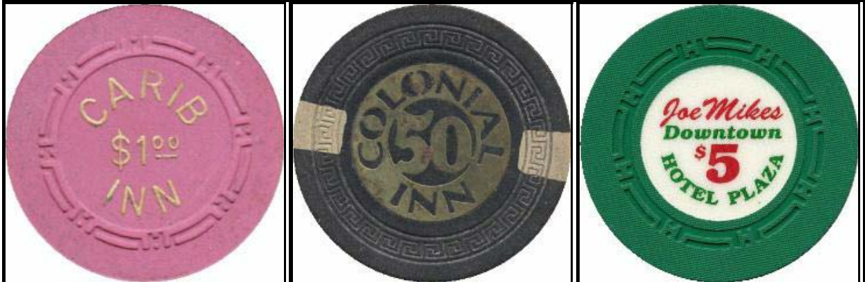
Carib Inn, PR